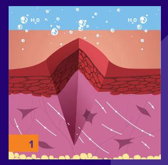
1. A surgical incision or injury creates a gap in the protective layers of the skin.

2. As the skin heals, it cannot hold moisture in as well. Extra moisture triggers (blue arrows) excessive collagen (red arrows). Without treatment, this action can lead to abnormal scarring.